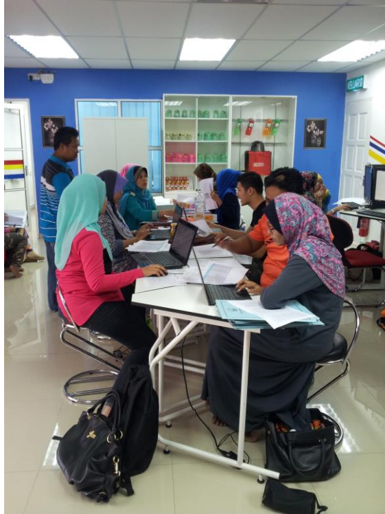
Guru-guru daripada SK Satak