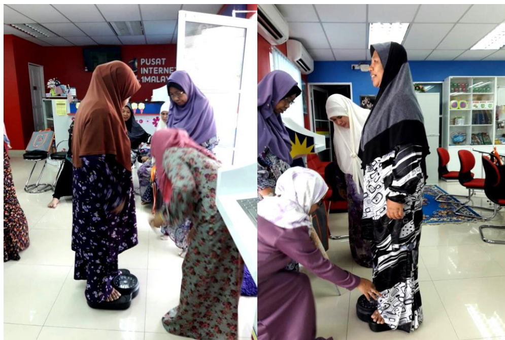
Menimbang berat badan