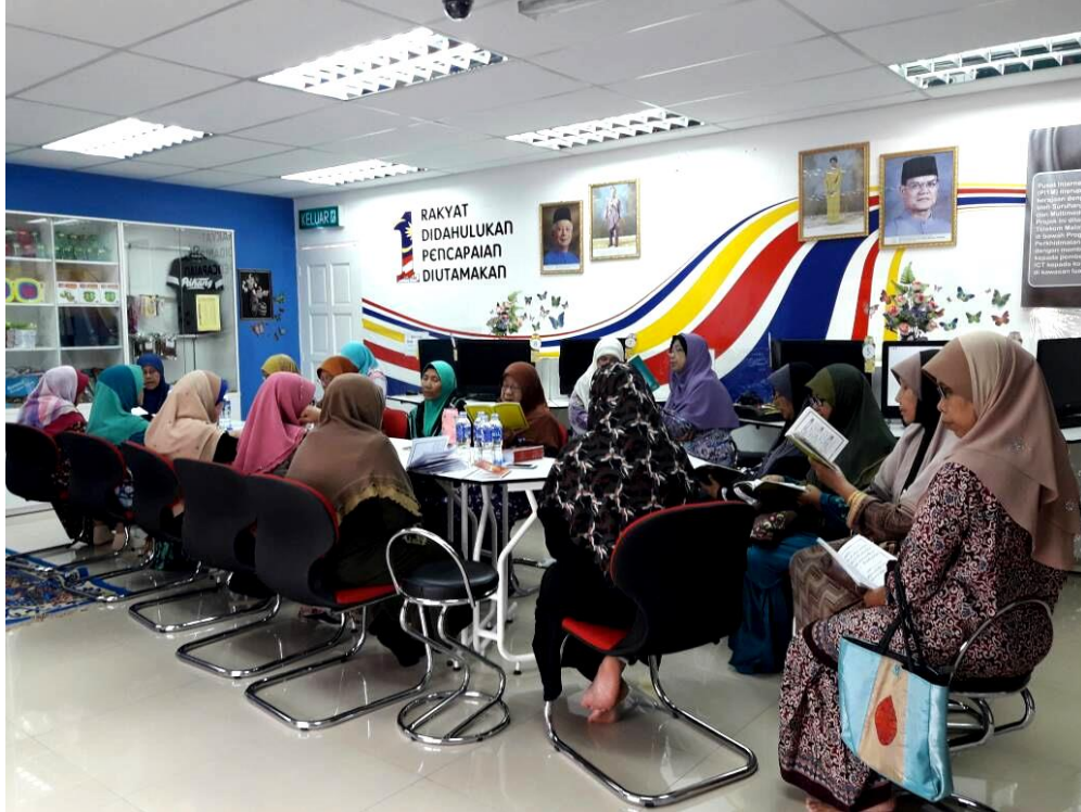
Bacaan Yassin oleh wanita Taman Mutiara 1