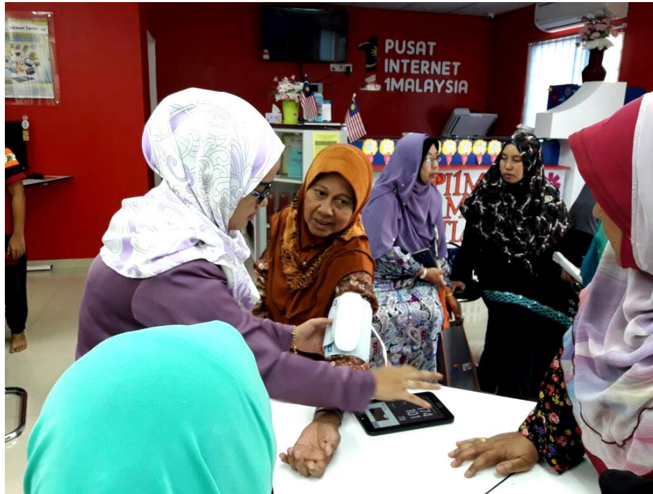
Pemeriksaan kesihatan menggunakan My Health