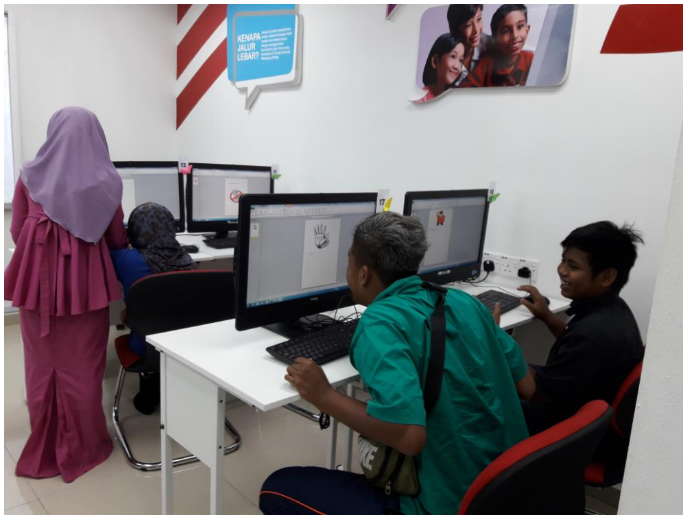
Suasana dalam bilik training