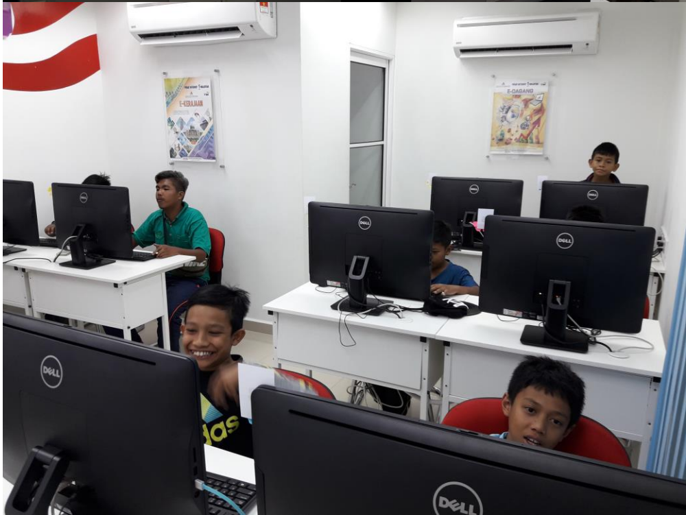
Suasana dalam bilik training